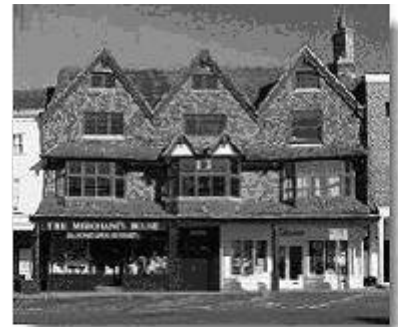
The Merchant's House, Marlborough