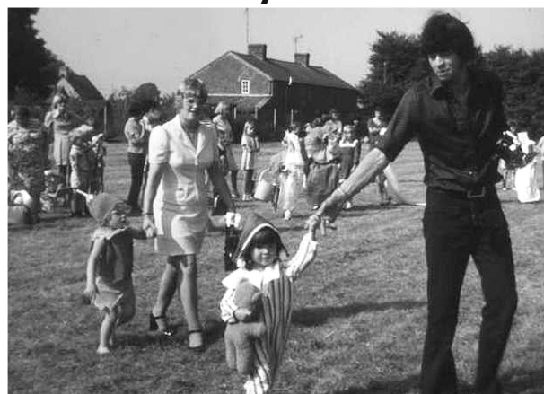
Fancy dress competition Southmoor circa 1974