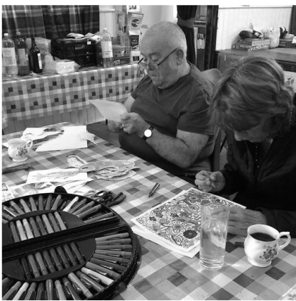
Always something going on at the Kingsmoor Club

A meal for four with two bottles of Pinot Noir, two starters and two desserts, four mains and pre-dinner drinks came to £112. Excellent value and highly recommended, oh those ribs! Eton Lovett.