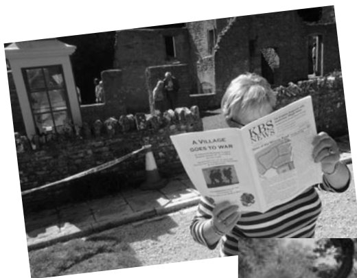
A mystery villager peruses her KBS News in the 'ghost' village of Tyneham in Dorset.