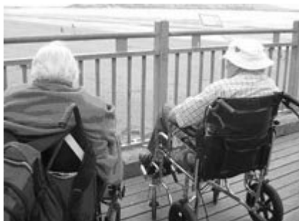
Enjoying the view from Weston Pier