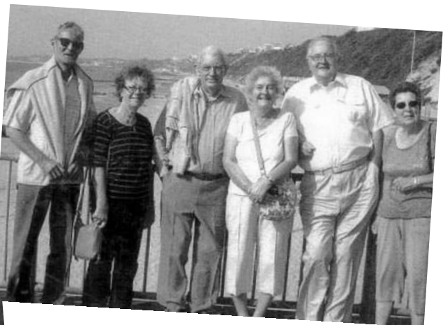
Bowls Club members on their trip to the South Coast at Fordingbridge Bowls Club (left pic) and on Boscombe Pier