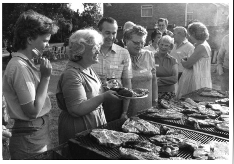
Anglo/American Barbecue in Bellamy/Norwood Ave., July 4th 1984