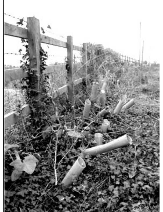
The butchered hedge on the A415 Witney Road

There are no caves in KBS. I think I am safe here but no doubt I will be corrected if I am not. Why do I say this? - to point out that at one point in time everyone's house was a "new development". For many of us, the argument has never been about "no development" but about the manner in which it should occur. I have no issue with owners/developers. Let's face it — if you owned land you would probably do the same if this meant obtaining lifelong financial security for you and your family. Likewise developers are obtaining returns for shareholders — possibly your pension fund. No, my major problems are with our elected officers and administrators, and with our village.