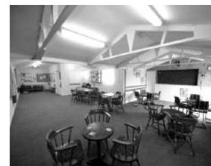
The new refurbished interior