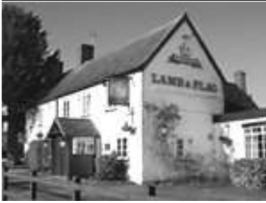
Lamb & Flag dates back 300 years