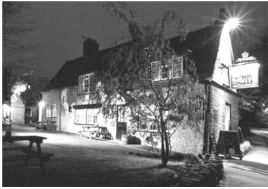
The Plough Inn dates back to 1683