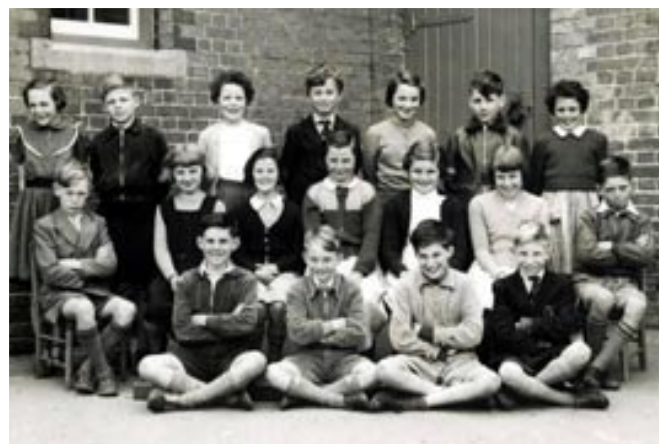
Pupils at Kingston Bagpuize school in the 1950's Where are they now?