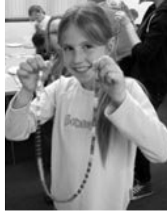
The venerable beads