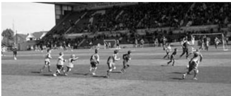
Kingston Colts under 8's playing at Swindon Town F.C.