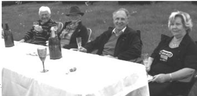
The Wine Quartet busy reviewing their selection for this month's choice at the recent Point-to-Point at Lockinge.

To tickle your taste buds this month we decided on two reasonably priced wines from Aldi in Botley -no we are not share holders-the store has a good selection of wine at various prices that will suit most pockets. We always say you don't know whether you have made the correct choice until you pull the cork or with these bottles the screw caps, anyhow we were not disappointed.