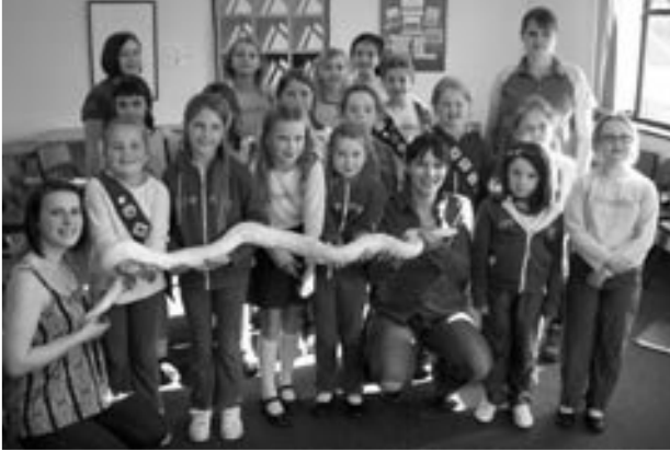
The Brownies with Samson the 7ft Burmese python