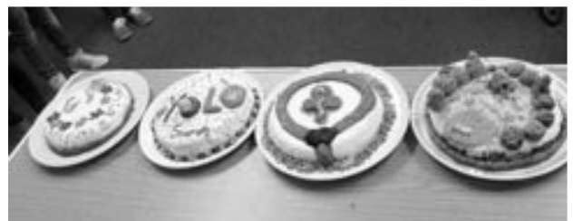
There's obviously a couple of budding Delia Smiths in the Southmoor Guides