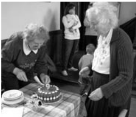
KBS Cafe celebrates their ninth birthday with a chocolate cake. Why not volunteer to become a helper?

We celebrated our 9th birthday last month with a party. People enjoyed a chocolate birthday cake and other goodies.