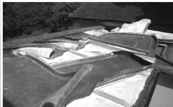
Our beleaguered Church Roof sans lead