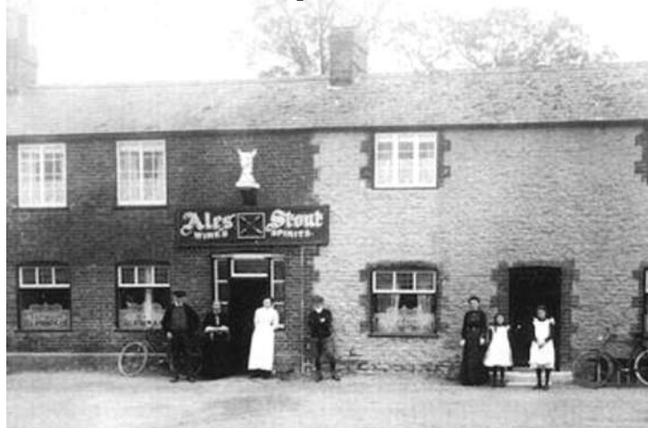
The Hinds Head circa 1910