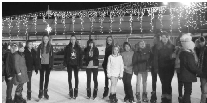
Guides Dancing on Ice at Millets Farm