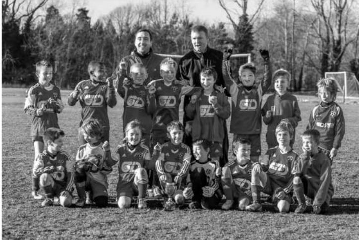
The lads and lassies of the U9s team with their Oxford Times trophy.