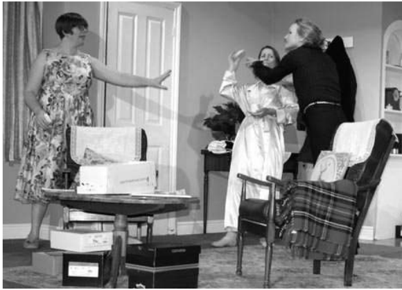
Martha & Liz nearly come to blows with Aunt Margie