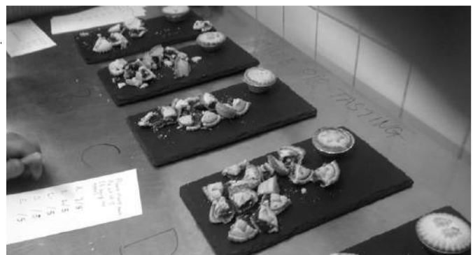
Mark Potts is Head Chef at Fallowfield's Hotel

The KBS News is delivered to every house in the village. Extra copies are available from the Post Office and One Stop shop.