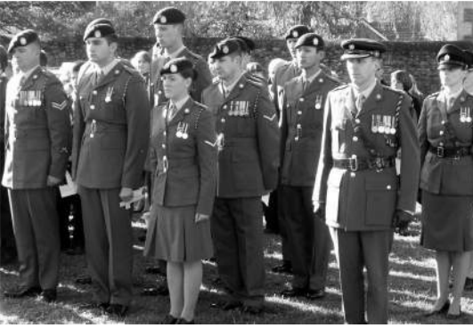
For the first time soldiers from Dalton Barracks attend our Remembrance Day