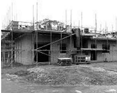
One of the points of interest on the village walk