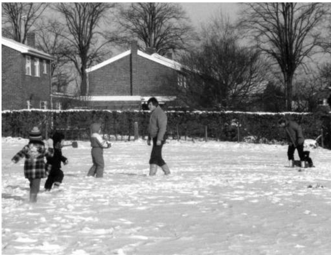
Winter fun in the snow December 1985, in the field where Stone House Close now stands.