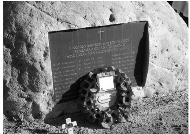
The Memorial stone to local men killed in WW1 & WW2