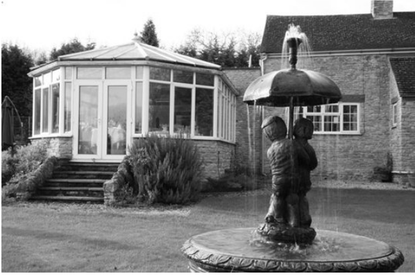
Rigoletto: Middleton Stoney's best kept secret.