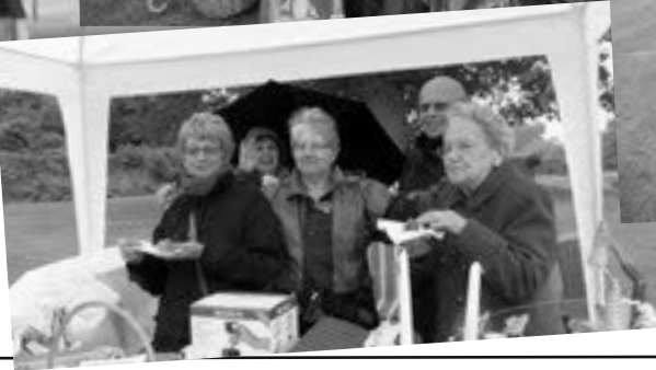
Some more of the entries for the 2013 Church Fete Photographic competition. Results next month.