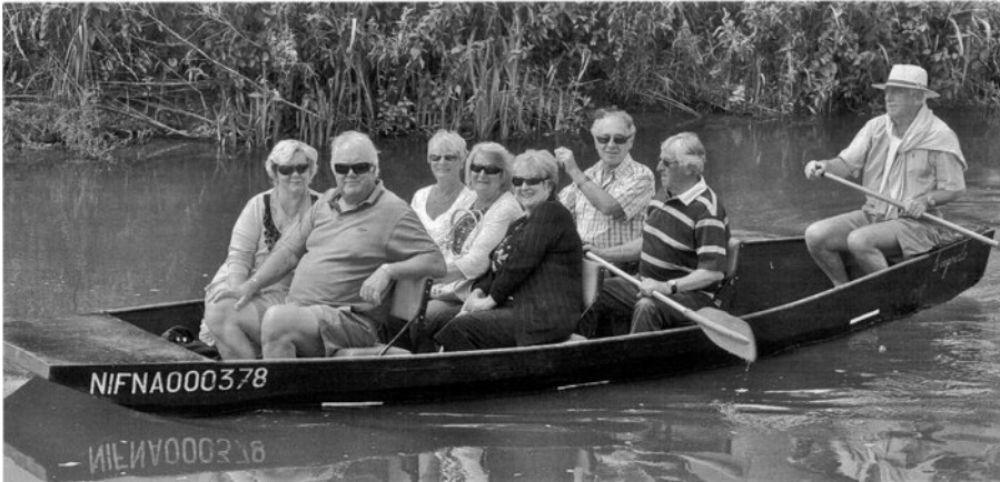
Intrepid club members negotiate the perils of the French outback.