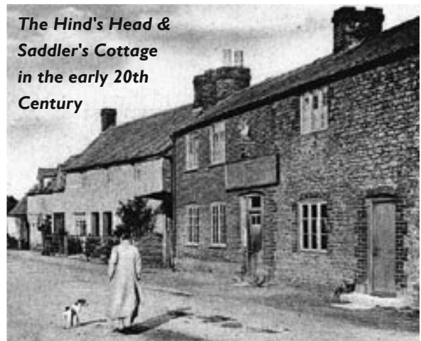
The Hind's Head & Saddler's Cottage in the early 20th Century